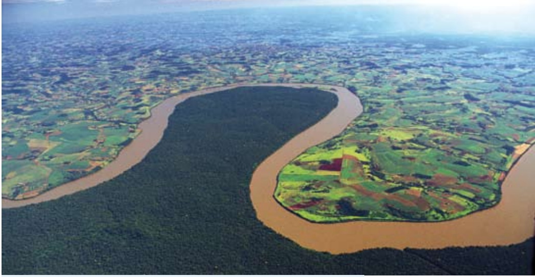
A bend in the Iguaco River shows the contrast between dense forest and agricultural expansion. The undisturbed forest on the near bank is part of the Iguacu National Park.